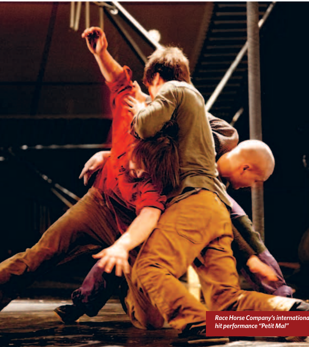
Race Horse Company's international hit performance "Petit Mal"