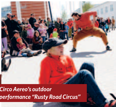
Circo Aereo's outdoor performance "Rusty Road Circus"

The objectives of cultural policy are connected to creativity, cultural diversity and equity. The aim is to realise cultural rights and ensure