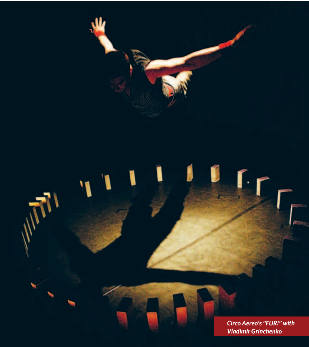
Circo Aereo's "FUR!" with Vladimir Grinchenko