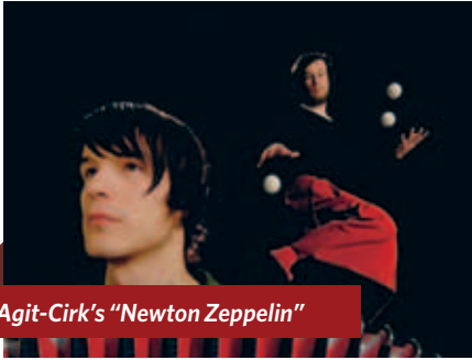
Agit-Cirk's "Newton Zeppelin"

deemed too heavy for circus to bear. Changes to the state cultural policy in the 1970s began to increasingly emphasise the importance of making culture at grass-roots level. The first youth circuses were founded in Finland at that time. Circus schools for children and youths started to become increasingly popular at the same time as the city and state were increasing support for people's free-time activities.