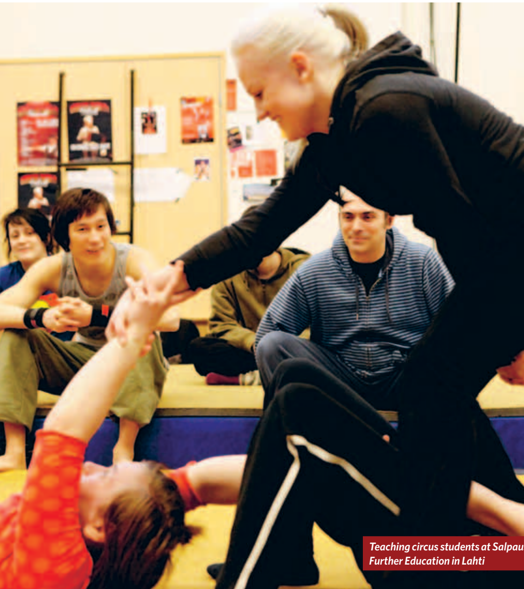
Teaching circus students at Salpaus Further Education in Lahti